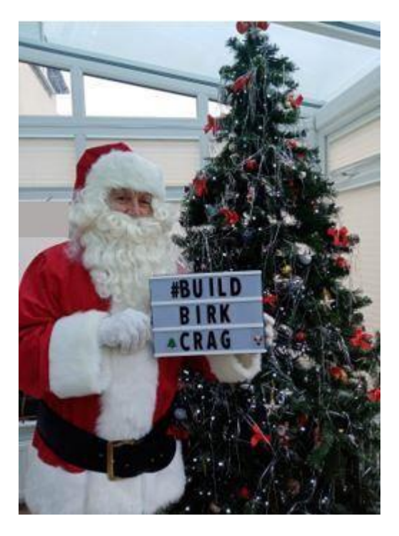
Even Father Christmas has found time in his busy schedule to support the Birk Crag Centre!