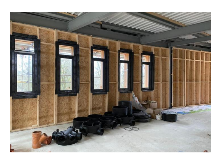
The internal windows are now in place on both floors.

A large proportion of the scaffolding has now been removed and the Centre is starting to really blend in with the surroundings.