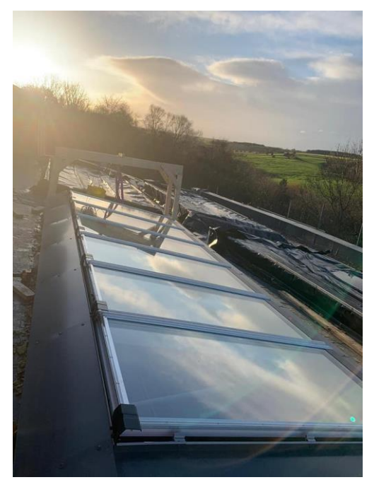
In November the rooflights were successfully installed helping to make the building watertight. What a view from the roof!

A large proportion of the scaffolding has now been removed and the Centre is starting to really blend in with the surroundings.